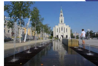
Gen. Peter Szembek Square