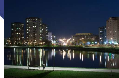
Park at the Balaton Lake