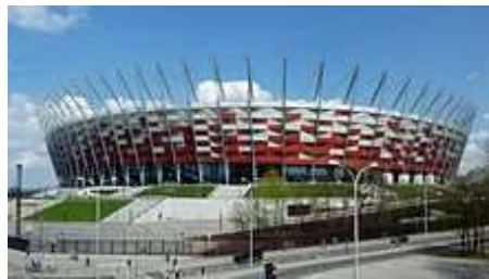
The PGE Narodowy National Stadium