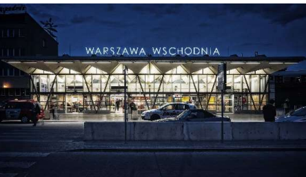
Warszawa-Wschodnia Railway Station