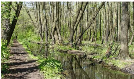
Nature Reserve Olszynka Grochowska