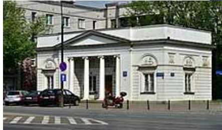
Rogatkı Grochowskie Grochow Tollhouses